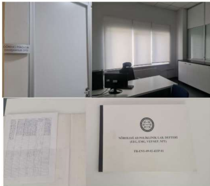
Student Psychological Counseling Office

According to Article 5 of the “Bursa Uludağ University Faculty of Medicine Student Counseling Directive”, there is a “Board of Advisors” consisting of the Vice Dean responsible for education, one faculty member from Basic Medical Sciences, Internal Medical Sciences and Surgical Medical Sciences, one faculty member from the Department of Psychiatry, one faculty member from the Department of Medical Education and one clinical psychologist. In addition to this institutional structure, a “Student Psychological Counseling Office” has been established within USİM, where clinical psychologists are assigned. Appointments are made through the MIAMED system through the USİM Secretariat for the office, which provides regular services to students on Tuesdays and Thursdays.