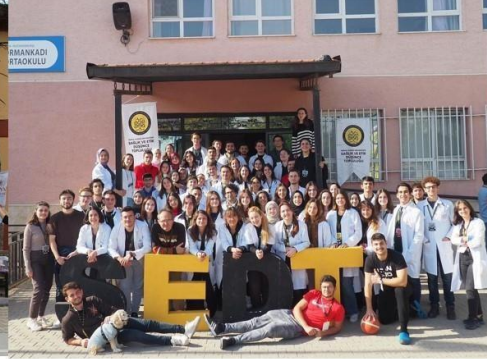
26. ÇADIR / 22-23 Ekim 2023 Mustafakemalpaşa-Ormankadı Köyü