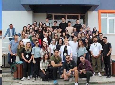
28. ÇADIR / 21-22 Ekim 2023 İznik-Çiçekli Köyü