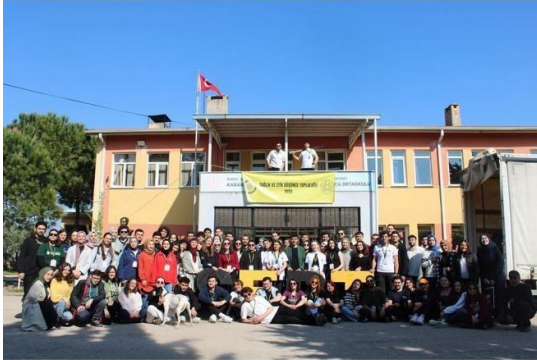
27. ÇADIR / 6-7 Mayıs 2023 Karacabey-Karakoca Köyü