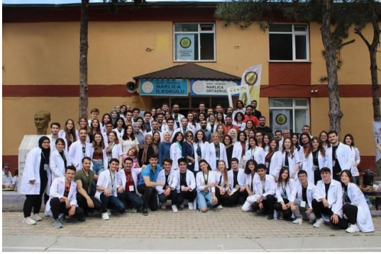
25. ÇADIR / 14-15 Mayıs 2022 Orhangazi-Narlıca Köyü

One of the most important events that brings together our faculty students and academicians, both in terms of professional and social responsibility, is the "TENT" days, which have been held since 1999 under the leadership of the Health Ethics and Thought Community (SEDT), known locally and nationally. https://tip.uludag.edu.tr/2023/tip-ogrencilerinin-cadir-projesi .