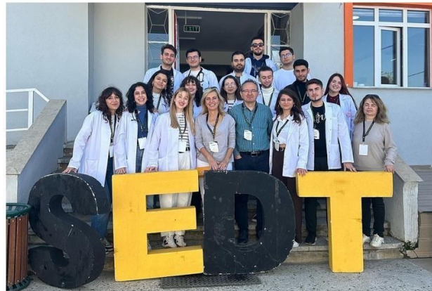
SEDT/ TENT event