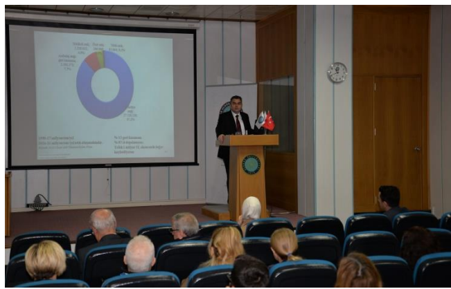
3. Zero waste representatives of the Bursa Uludag University Main Campus (left), an example of regular training activities on recycling programs (right)