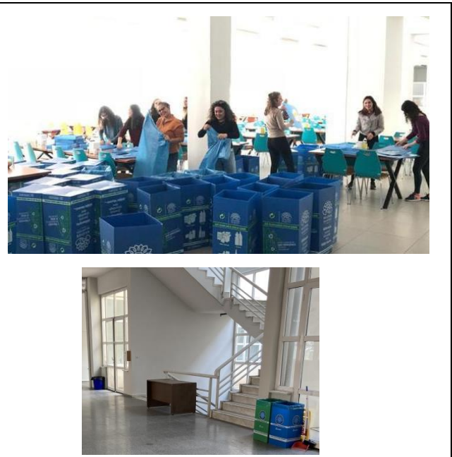
2. Training programs on the application of recycling program, recycling bins in the buildings (one container for recyclables, one container for organic waste)