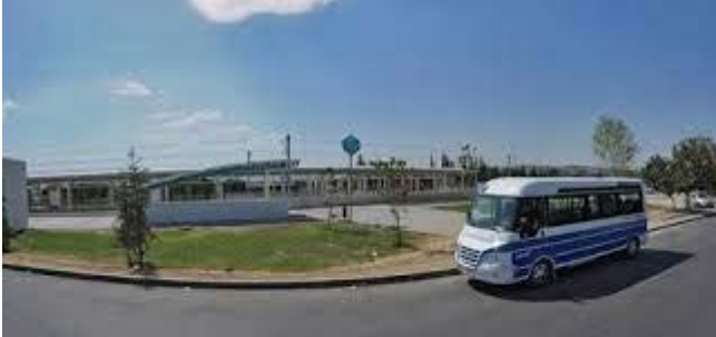
4-Minibus lines to the campus: Minibuses are also available to carry students between the student town to the campus Minibuses in the campus: Minibuses within the campus carry the students within the campus