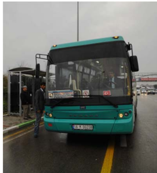
City buses reach the university from many points of the city