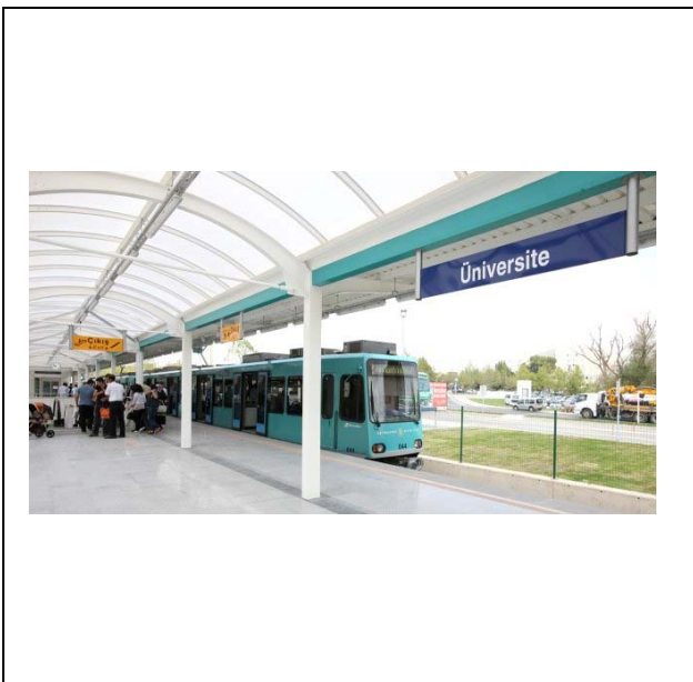
Metro station at the entrance of the campus (Bursa Uludag University, Turkey)