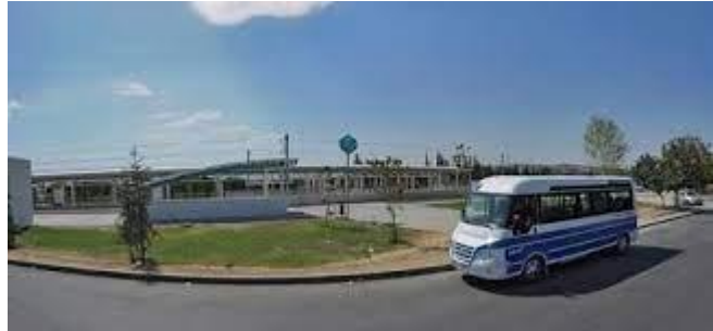
4-Minibus lines to the campus: Minibuses are also available to carry students between the student town to the campus

Minibuses in the campus: Minibuses within the campus carry the students within the campus