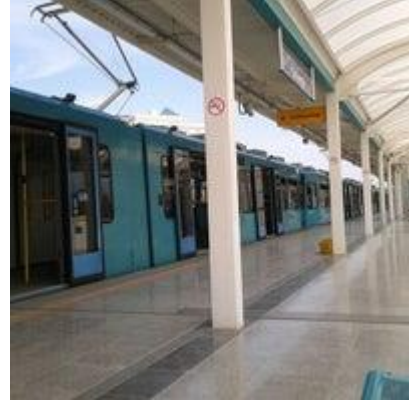
Metro station at the entrance of the campus (Bursa Uludag University, Turkey)