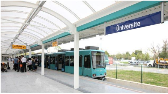
3-Metro station at the entrance of the campus (Bursa Uludag University, Turkey)