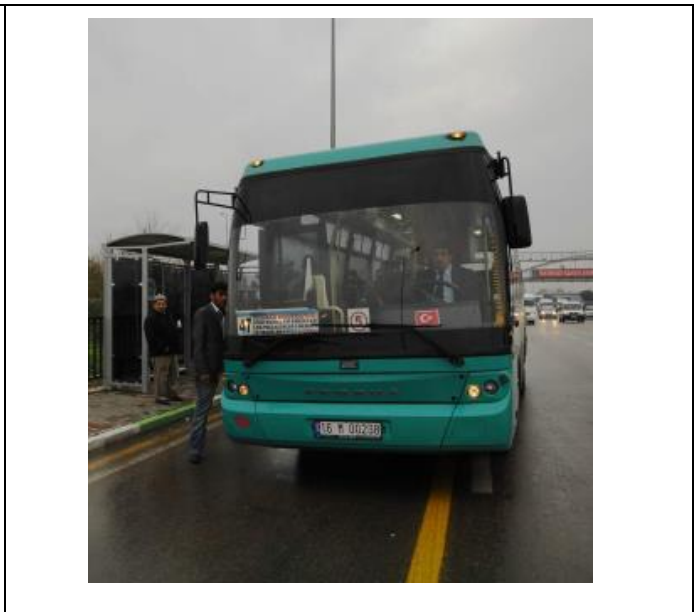
City buses reach the university from many points of the city