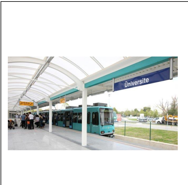
Metro station at the entrance of the campus (Bursa Uludag University, Turkey)