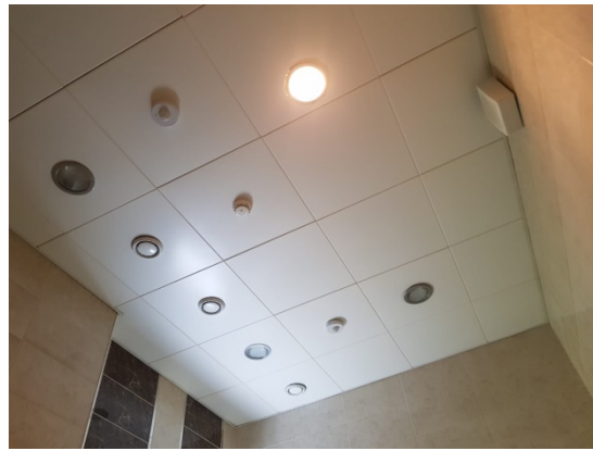
Example of Energy Efficient Appliances Usage: Use of LED lighting (Bursa Uludag University, Turkey)