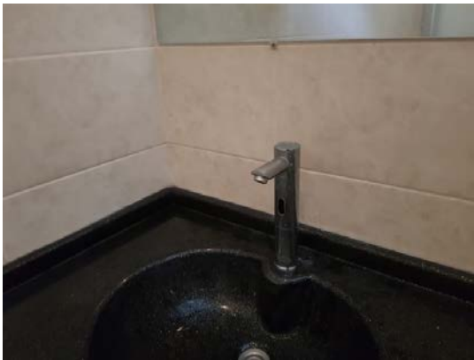
Example of Energy Efficient Appliances Usage: Photocell Faucet (Bursa Uludag University, Turkey)