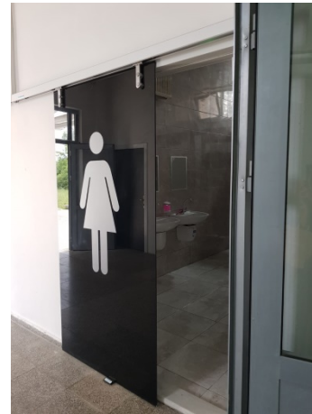
Example of Energy Efficient Appliances Usage: Photocell Door (Bursa Uludag University, Turkey)