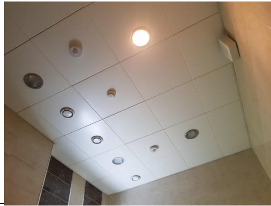
Example of Energy Efficient Appliances Usage: Use of LED lighting (Bursa Uludag University, Turkey)