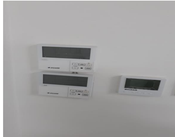
Example of Energy Efficient Appliances Usage: Energy Conserving Air Conditioners (Bursa Uludag University, Turkey)