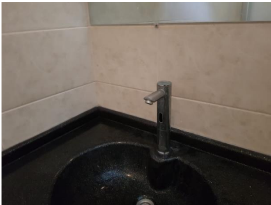
Example of Energy Efficient Appliances Usage: Photocell Faucet (Bursa Uludag University, Turkey)