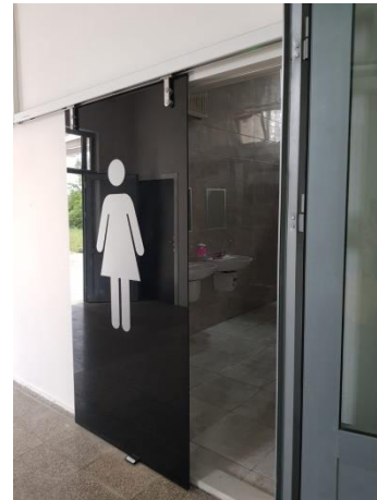
Example of Energy Efficient Appliances Usage: Photocell Door (Bursa Uludag University, Turkey)