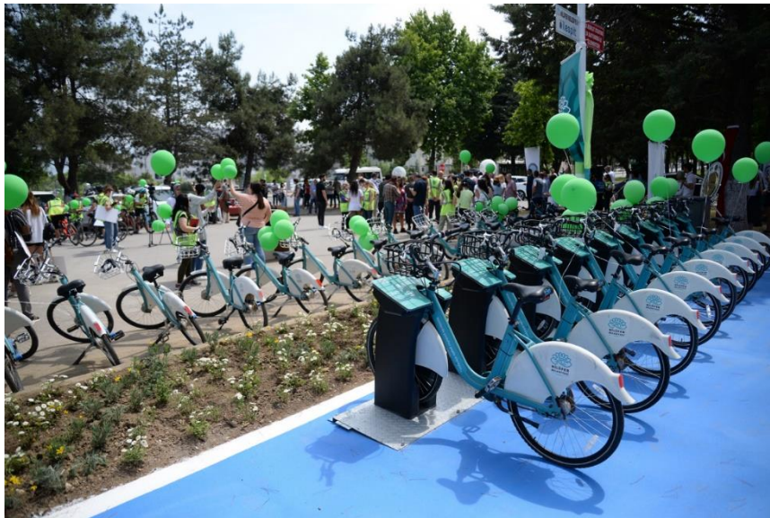
Bicycle Parks Opening