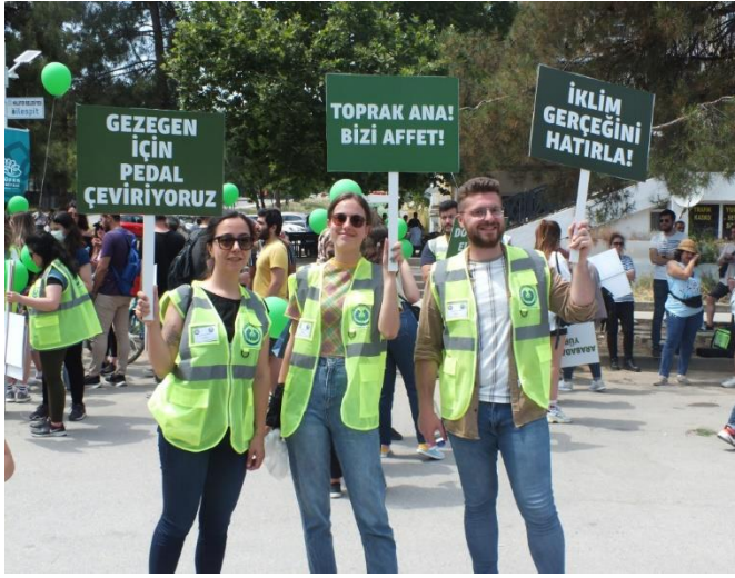
World Environment Day: Traditional Environmental Walk