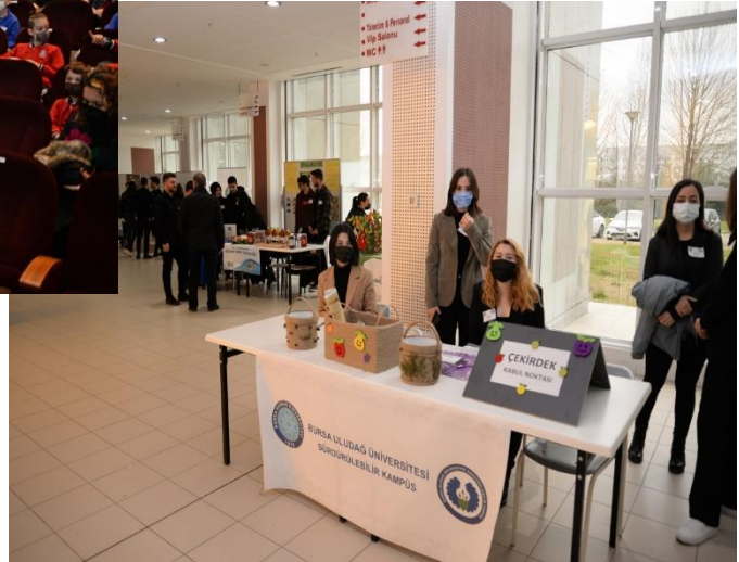
Meet Sustainability Event