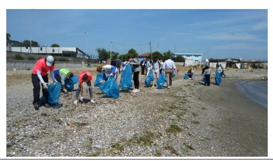
Examples of Events Related to Sustainability: Trash Collection at the Seaside (Bursa Uludag University, Turkey)

Examples of Events Related to Sustainability: No Elevators Day at the Campus (Bursa Uludag University, Turkey)