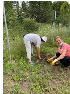
Examples of Events Related to Sustainability: Tree Planting (Bursa Uludag University, Turkey)