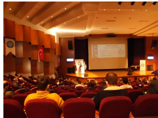
Examples of Events Related to Sustainability: From Waste to Art (Bursa Uludag University, Turkey)