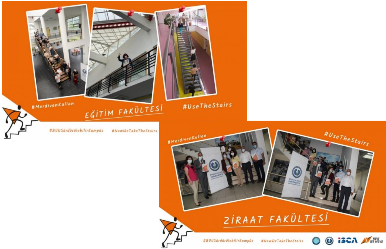
Examples of Events Related to Sustainability: No Elevators Day at the Campus (Bursa Uludag University, Turkey)