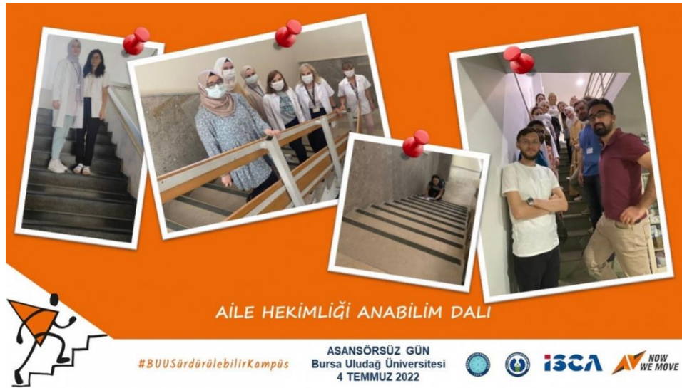
Examples of Events Related to Sustainability: No Elevators Day at the Campus (Bursa Uludag University, Turkey)