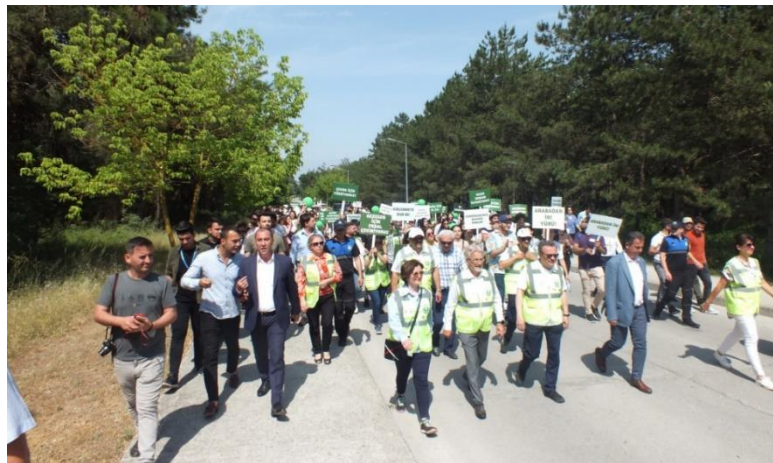
Examples of Events Related to Sustainability: World Environment Day: Traditional Environmental Walk (Bursa Uludag University, Turkey)