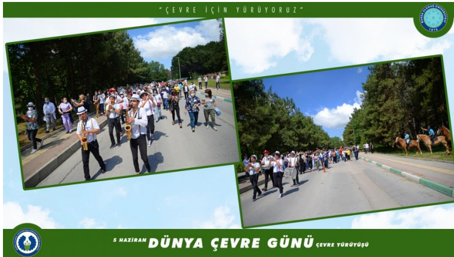
Examples of Events Related to Sustainability: Campus Walk at World Environment Day (Bursa Uludag University, Turkey)