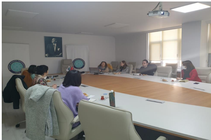
Examples of Events Related to Sustainability: Sustainability Report Preparations (Bursa Uludag University, Turkey)