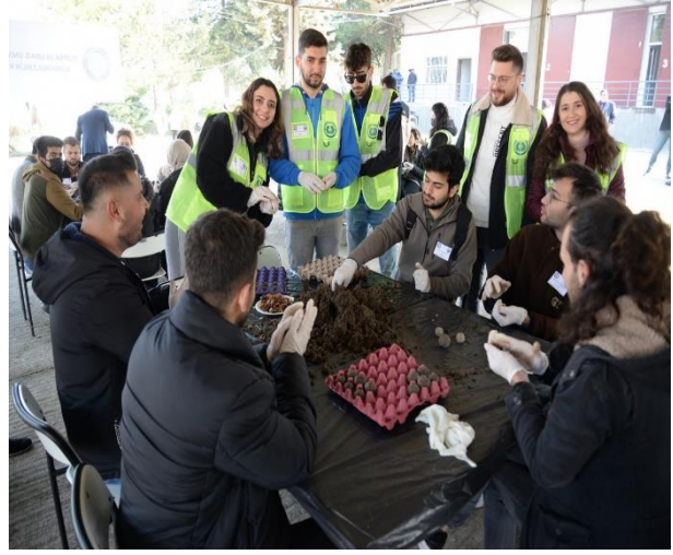
Examples of Events Related to Sustainability: Seed ball workshop (Bursa Uludag University, Turkey)