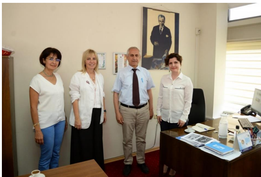
Examples of Events Related to Sustainability: Tobacco Free Campus (Bursa Uludag University, Turkey)