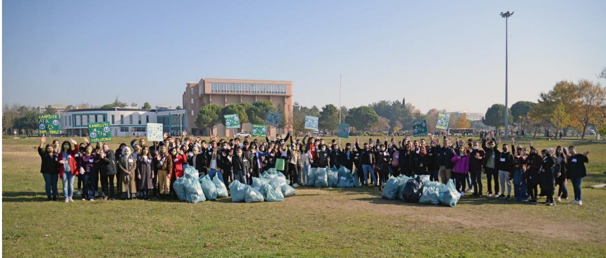
Examples of Events Related to Sustainability: Waste Collection on Campus (Bursa Uludağ University, Turkey)