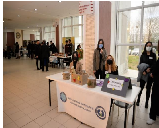
Examples of Events Related to Sustainability: Meet Sustainability Event (Bursa Uludağ University, Turkey)