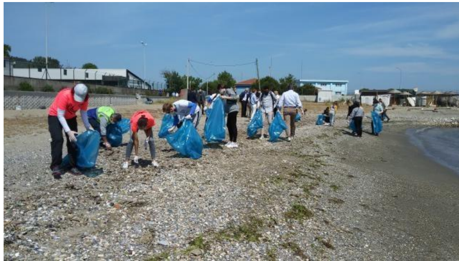
Examples of Events Related to Sustainability: Trash Collection at the Seaside (Bursa Uludag University, Turkey)