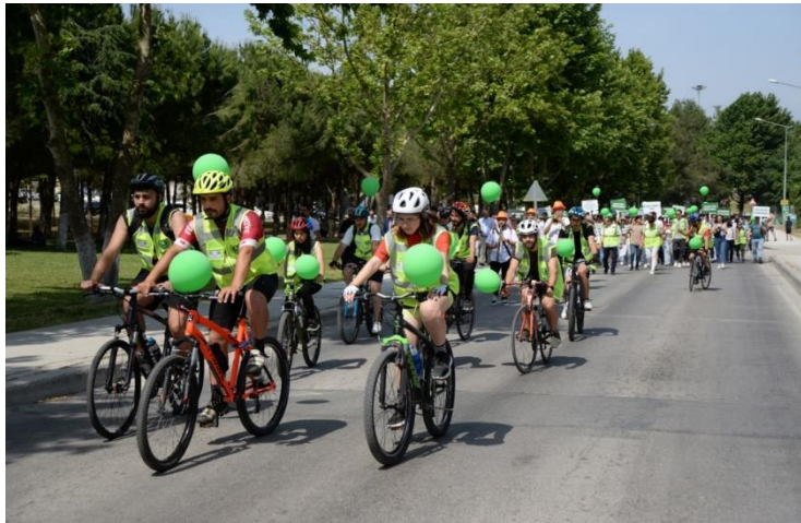
Examples of Events Related to Sustainability: Bicycle Parks Opening (Bursa Uludag University, Turkey)