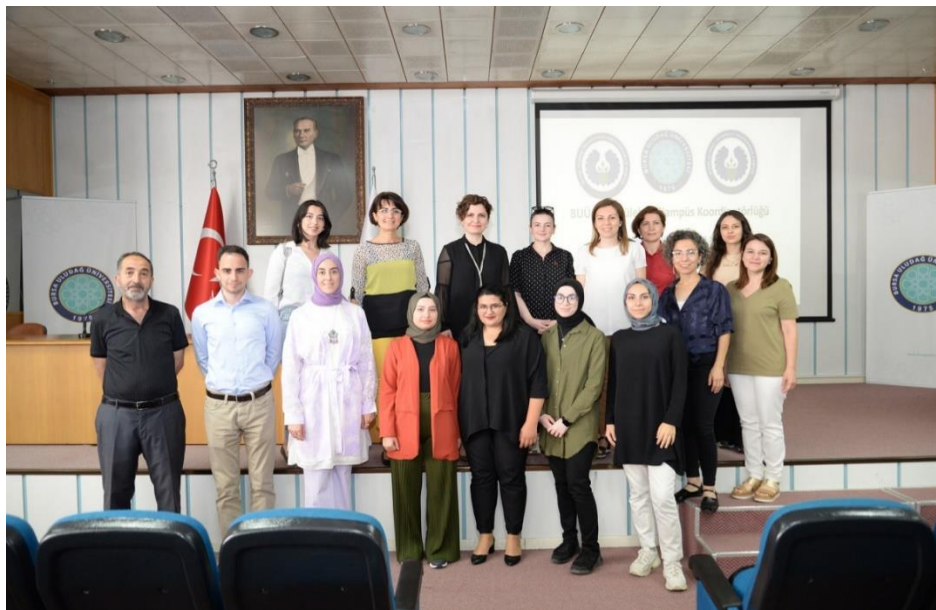
Examples of Events Related to Sustainability: Volunteer Meeting (Bursa Uludag University, Turkey)