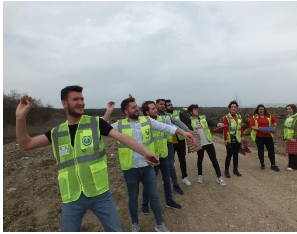
Examples of Events Related to Sustainability: Throwing a Seed Ball (Bursa Uludag University, Turkey)